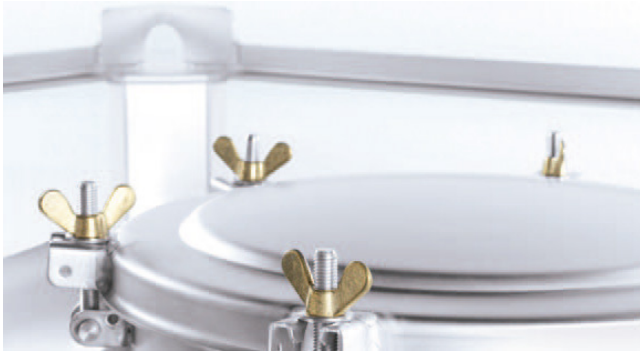
Top cover according to dn 400 and compliant with food and pharmaceutical industry. Clamping ring cover dn 400 with hinge.